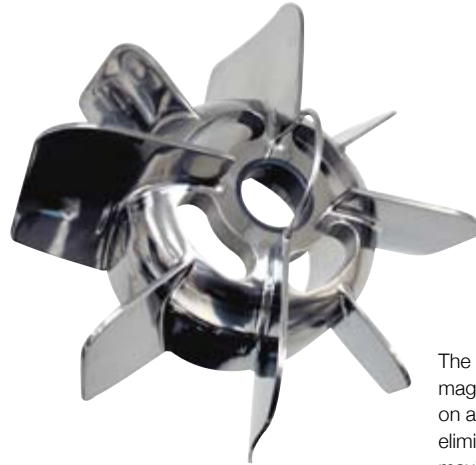
The impeller of Alfa Laval's magnetic mixers levitates on a magnetic field, which eliminates friction and maximizes cleanability.

Which technology is right for you depends on your application and goals. And since Alfa Laval offers all three technologies, we can assist you in finding the perfect match.