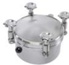
Pressure cover HLSD-2