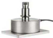
Weighing system UltraPure