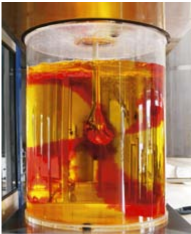
Iso-Mix rotary jet mixers inject fluid, gas or powder through rotating jet nozzles – without causing the liquid to rotate.