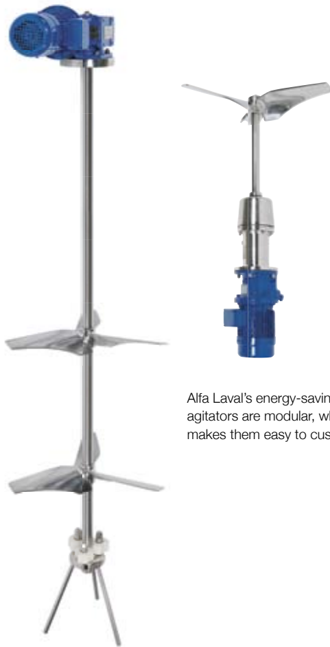
Alfa Laval's energy-saving agitators are modular, which makes them easy to customize.

Our Iso-Mix rotary jet mixers create savings in other ways. Driven by pump, they inject fluid, gas or powder through rotating nozzles beneath the liquid surface. No baffles are required, and the mixing heads double as tank cleaning equipment at the end of the mixing cycle. But most importantly, the high-intensity of the mixing translates into rapid payback. Breweries, for example, have used rotary jet mixers to shorten fermentation time by 30%.