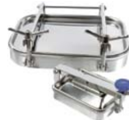
Access tank cover C-O-R