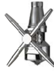
Iso-Mix rotary jet mixer