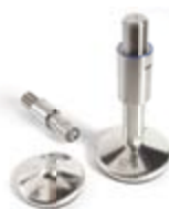
Machine feet and tank feet