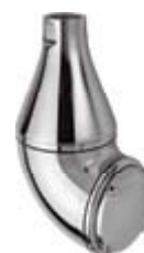
Toftejorg SaniJet 25