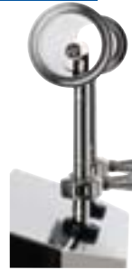
Pitot tube for connection to the water system.