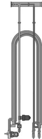
Fig 2. Cooling mode: The cooling water valve opens. The recirculation valve is closed and the product flows in the opposite direction. Cold water is available within seconds.