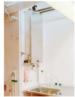
Pharma-X module installed as a point-of-use cooler at AstraZeneca, Sweden.