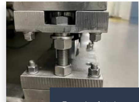
Example of strain gage load cell mounted with transport lock.