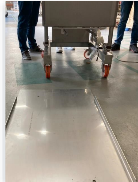
Aluminum plate Thickness: ~3 mm

After rolling over the aluminum and wooden plates of 3 and 4 mm, the weighing indicator cells displayed a variation of between 0.010% and 0.020% of full-scale after impact without utilizing lockouts or any protective devices. These results were within the MPE (Maximum Permissible Error) requirements of the biopharma manufacturer.