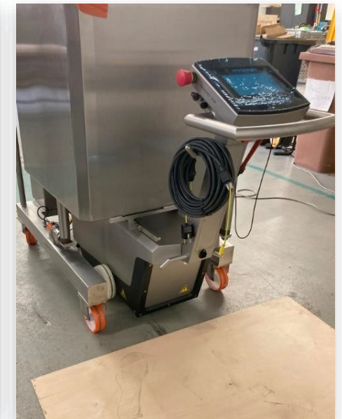
Wooden plate Thickness: ~4 mm