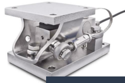
Example of strain gage load cells with side- and overload protection.

To overcome these challenges, the biopharma manufacturer installed a mechanical “transport lock” by each strain gage load cell to protect the load cell from the impact of bumps and sloshing liquids whenever the tote was moved around the facility. For this system to work properly, the daily operators would have to manually engage and disengage the brackets before and after moving the tote. In practice this action was frequently forgotten, causing deviations, and requiring recalibration of the weighing systems. To solve this important issue, the biopharma manufacturer approached the Belgian mechanical and electrotechnical engineering firm, specializing in the design and production of parts for pharmaceutical companies.